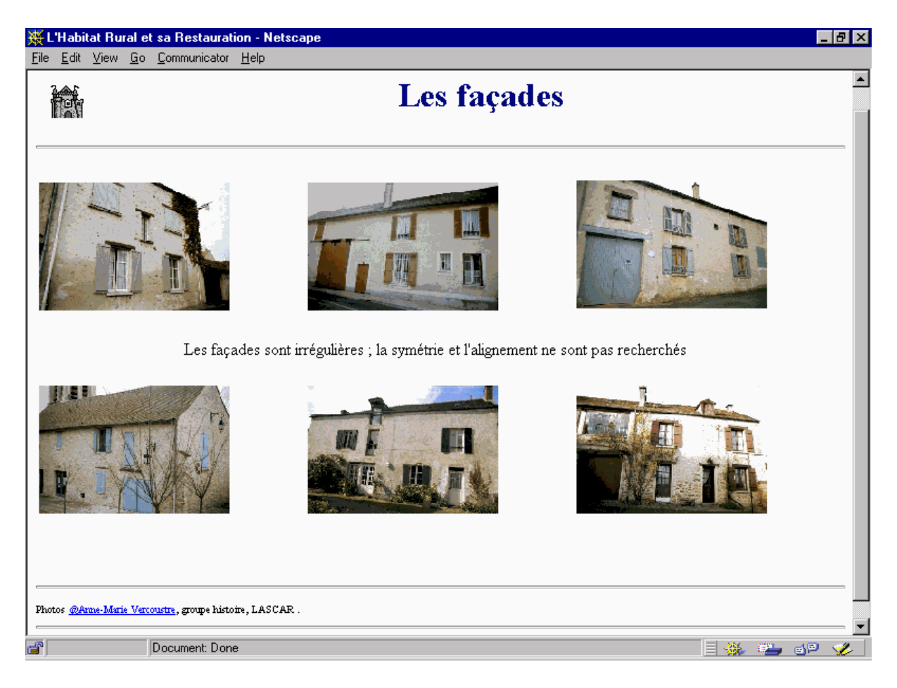
Figure 2: Example of photos Full size image

Examples of photos can be seen in Figure 2.