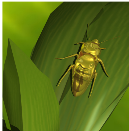
Fig. 1. The Edgar Poe Gold Bug is rendered with a full spectral function representation while the main part of the 3D scene is computed with RGB models

This paper presents the rendering process of complex scenes with both the full spectra and RGB light and object interactions. Unlike conventional systems that perform color calculations with tristimulus color values, our system allows to embed any kind of representation of the spectra to calculate colors of complex optical effects. Unlike spectral rendering systems previously proposed [1], our rendering process allows to use and compute spectra in complex scenes only when it is needed, i.e. when they have a significant impact in the transport process, and the final image.