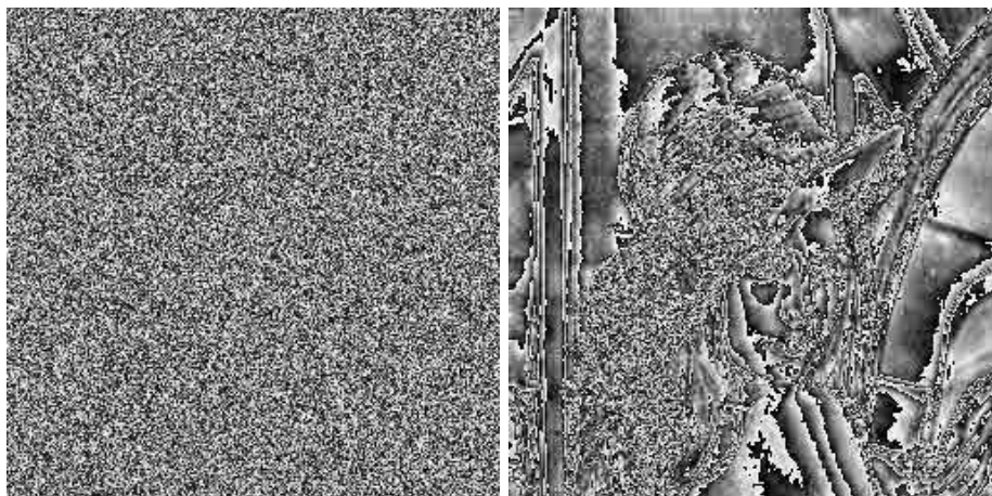
Figure 7: Left : Uniform white noise - Right : Quantization noise

Quantization noise has a small TV, while uniform noise has a large TV. In our MAP approach, the l^\infty -norm is supposed to model the noise, and TV the images. Actually, the reason why it works in the case of white noise, is that TV not only models the image but also what is not noise.