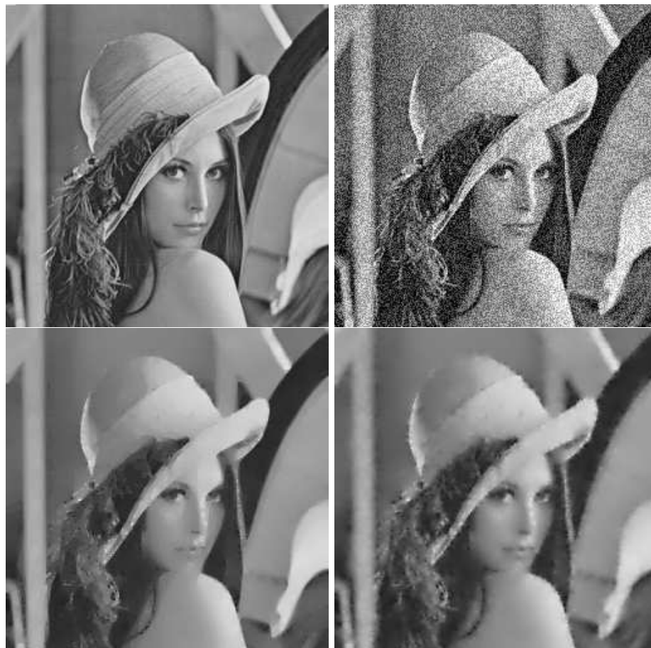
Figure 4: TL : lena image on [0, 1] - TR : lena image + U([-0.2, 0.2]) BL : Denoised with BV - L^\infty BR : Denoised with MinSurface - L^\infty