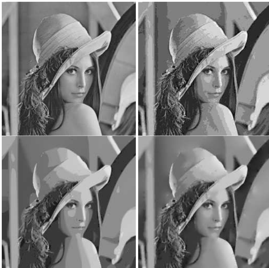
Figure 6: TL : original image - TR : Quantized Lena on 10 levels BL : 'Dequantized' with BV - L^\infty BR : Dequantized with MinSurface - L^\infty