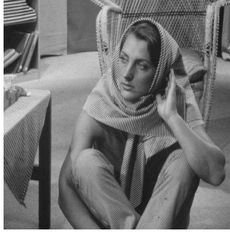
Figure 2: Original Barbara image

Y. Meyer's discretized model does not seem as promising as in the continuous setting. We will lead further investigations to figure out the reason for that.