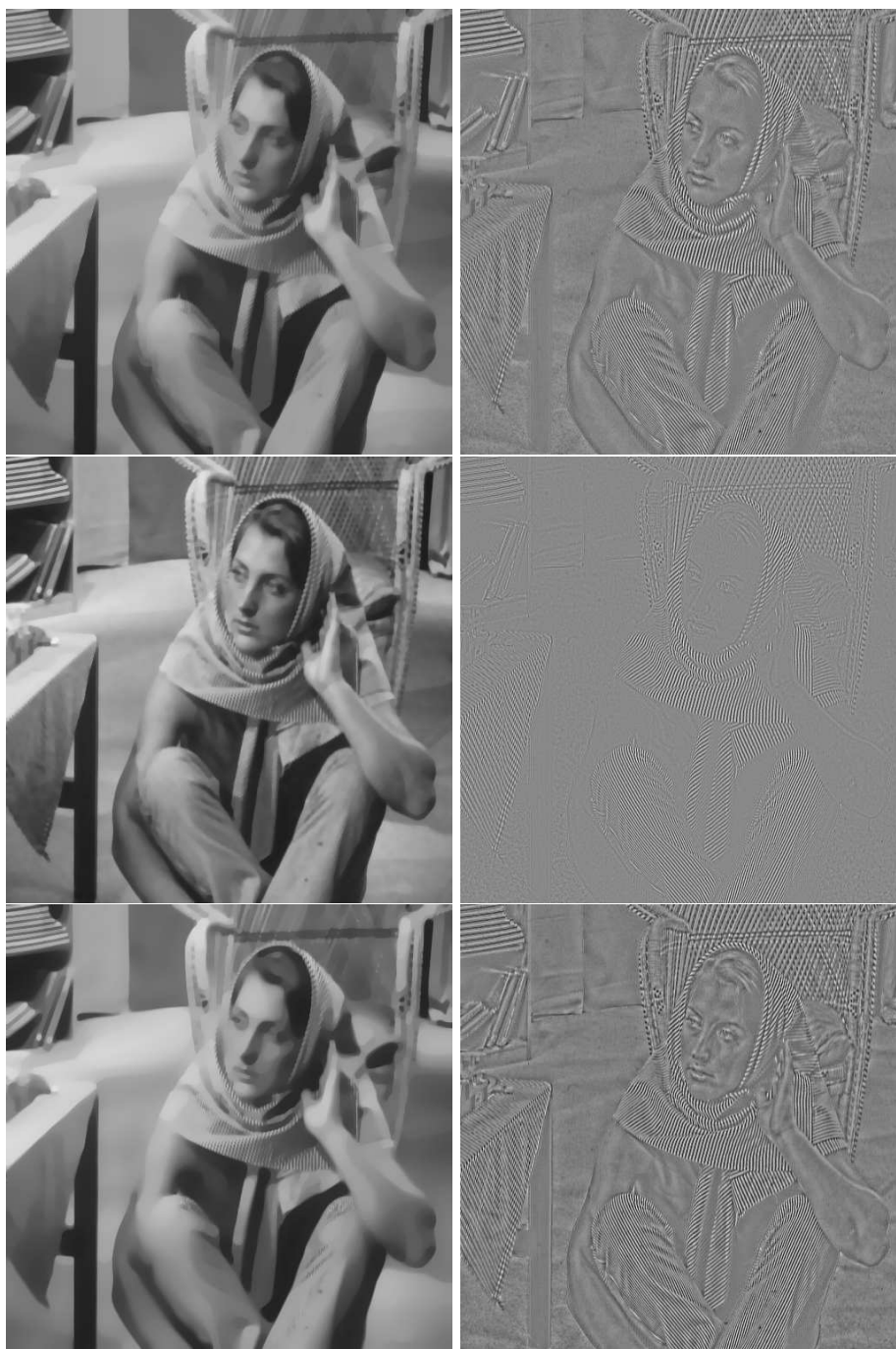
Figure 3: TL : Cartoon part for ROF model - TR : Texture part for ROF model - ML : Cartoon part after 4 seconds - MR : Texture part after 4 seconds - BL : Cartoon part after 5 minutes - BR : Texture part after 5 minutes