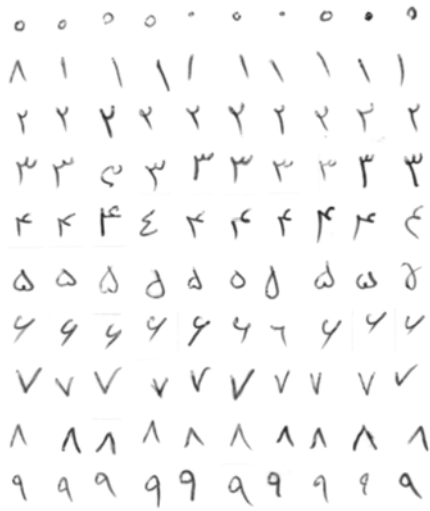
Figure 6. Handwritten Farsi digit samples.