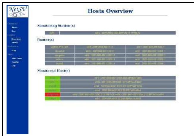
Figure 2. NetSV - Problem in addressing

is set for this prefix. If during a defined period it did not receive any packet destined to the address corresponding to the obsolete prefix, the transition is supposed done for this host. By default, no filter is set, all the packets are analyzed. To monitor specifically some services (HTTP server...), it is possible to define filters by using the same syntax than for tcpdump.