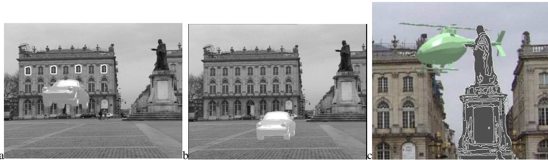
Figure 2: (a) Registration using only 2D/3D correspondences; (b) Registration with the mixing method (c) Occlusion resolution.