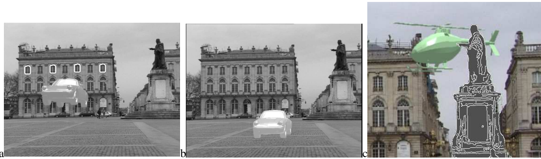
Figure 2: (a) Registration using only 2D/3D correspondences; (b) Registration with the mixing method (c) Occlusion resolution.