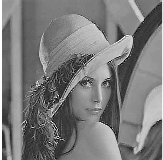
Figure 2: forged content by malicious attack

This performance highly depends on the design of the filter h . This paper brings credits to the feasibility of asymmetric techniques.