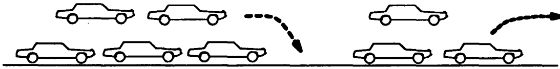
Figure 1: Parking problem with finite sojourn time

unit, (iii) the cars parks during an exponential sojourn time of mean one time unit. We also consider the limiting case where m = \infty . Point (iii) is the essential difference between our problem and exercise 29 of Knuth. See the nice figure 1 for an illustration.