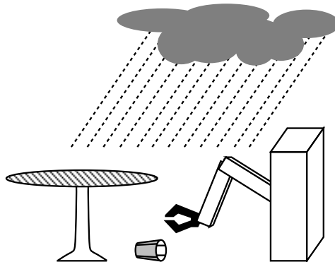
Figure 2: An illustration of the cup domain.

Consider as an example the cup domain, which is inspired by [Chrisman and Simmons, 1991]; Figure 2 is meant to vivify the imagination. The task of a robot is to manipulate a cup from some position, using several actions to be detailed later. The cup can be either on the floor ( onfloor ) or on a table ( ontable ). When on the floor, the cup can either stand upright ( up ), or be tipped forward with its mouth facing the robot ( forward ), or be tipped backward ( back ). Experiments take place outside; thus rainy weather ( rainy ) might affect the robot’s performance. The language of the cup domain, \mathcal{L}_c , is the first order language induced by the ground atom set \{\text{onfloor}, \text{ontable}, \text{up}, \text{forward}, \text{back}, \text{rainy}\} ; a world is every set of ground literals made of exactly these ground atoms. (As a notational convention, we will use a subscript c for names referring to constructs in the cup domain.)