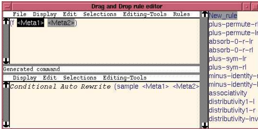
Figure 4: The drag-and-drop rule editor. The top left window contains the formula pattern and indicates the start and end positions. The bottom left window contains the triggered rewrite command. The right window shows the ordered list of rules.