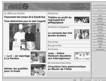
a) A summary page