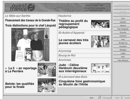
a) A summary page