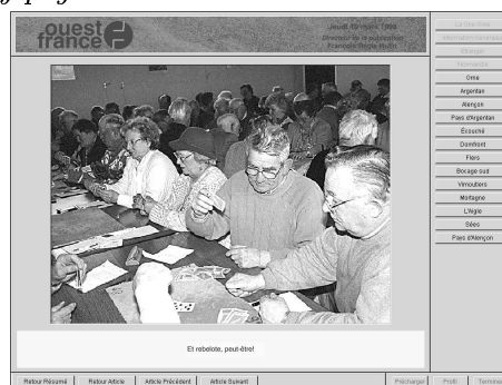
c) A photograph page