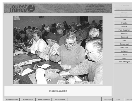
c) A photograph page