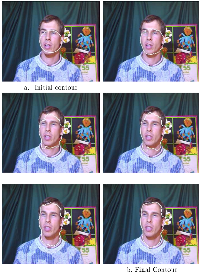
Figure 2: Evolution of the active contour on the current frame number using the two reference histograms of the previous frame