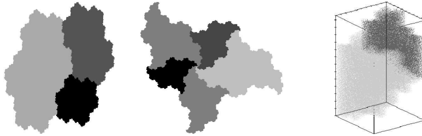
Figure 1: The Rauzy geometric one-sided representation for the Tribonacci-shift, the smallest Pisot number-shift and the 2 + \sqrt{2} -shift.

Let \beta = 2 + \sqrt{2} be the dominating root of the polynomial X^2 - 4X + 2 . The other root is 2 - \sqrt{2} . One has d_\beta(1) = d_\beta^*(1) = 31^\infty . The ideal 2\mathbb{Z} is ramified in \mathcal{O}_{\mathbb{Q}(\sqrt{2})} , that is, 2\mathbb{Z} = \mathcal{I}^2 . Hence there exists only one ideal which contains simultaneously \sqrt{2} and 2; its index of ramification is 2. Its geometric one-sided representation \mathcal{R}_\beta is a subset of \mathbb{R}_2 \times \mathbb{Q}_2 \times \mathbb{Q}_2 , shown in Fig. 1. There are two different shades.