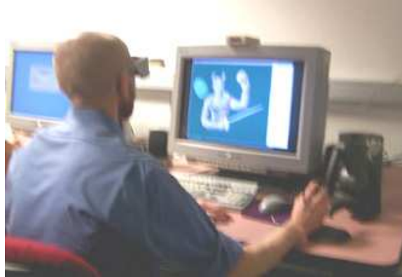
Figure 3: A user modeling a character with the virtual sculpture software and a Phantom desktop device.