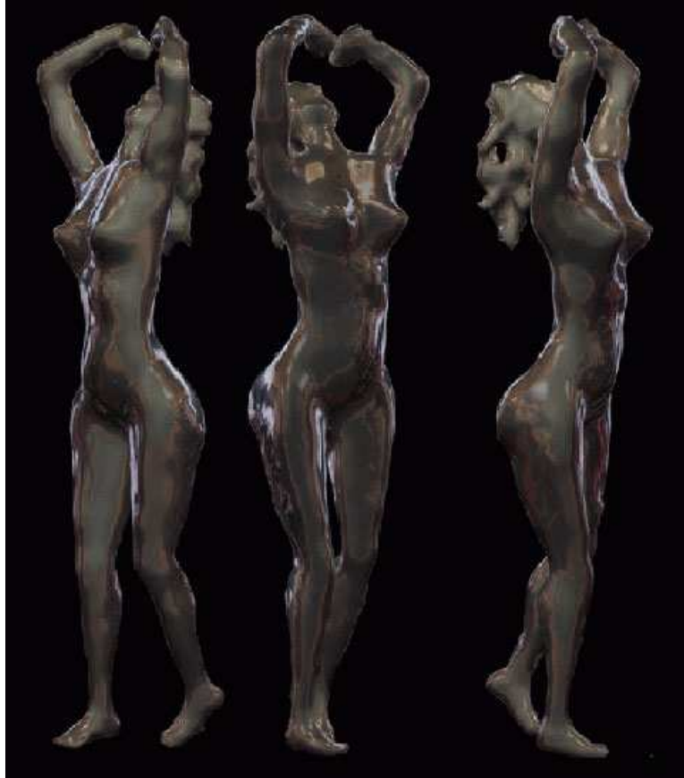
Figure 5: This sculpture was achieved by one of the authors with haptic feedback within less than 1 hour.