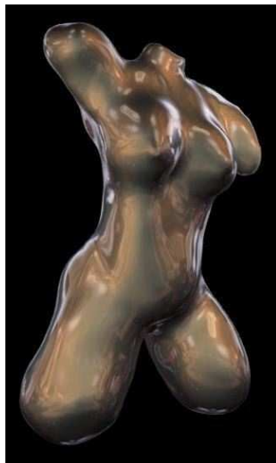
Figure 1: An artwork modeled with a virtual sculpture application. This sculpture was achieved without haptic feedback within 4 hours. (Illustration extracted from [6])

This paper proposes an effective solution to the incorporation of expressive haptic feedback in a volumetric sculpting system, together with a simple solution for reducing the instability problems during the interaction. As our results show, our new haptic rendering improves interactivity and immersion, thus making the sculpting system far easier to use.