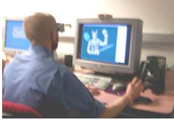
Figure 3: A user modeling a character with the virtual sculpture software and a Phantom desktop device.