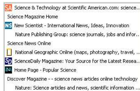
Fig. 2. A screen capture of the context assistant. The user is located on the web site of the Scientific American journal. At this location, the user's context essentially contains links to science related web sites, and particularly links to other journals.

To illustrate the benefits of such guide, we present a scenario showing how it can be used to combine virtual and physical navigation.