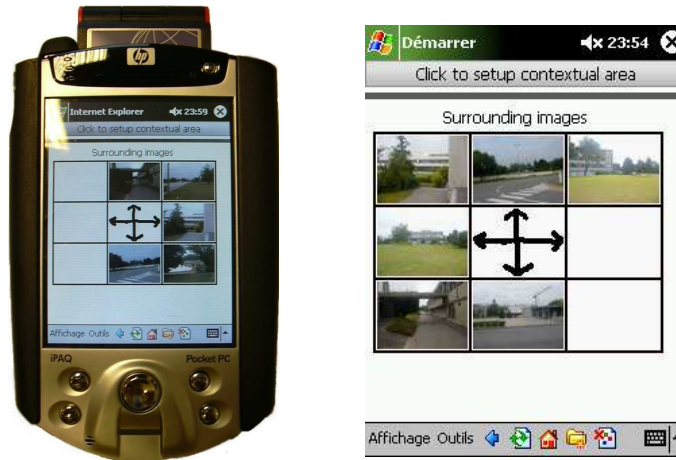
Fig. 3. Left: a photo of the Pocket PC equipped with a GPS receiver and running the photos application. Right: a screen capture of the application showing the physically close photos.

The right side of the figure 3 presents the interface of the application. Since the screen of the guide has a limited size, the application presents a maximum of nine photos to the user organized in an array. These photos are located in the array according to the current user’s orientation. The photo located at the top of the screen has been taken in front of the user. Similarly, the photo located at the bottom right of the screen has been taken behind the user on his right. Such representation enables the user to precisely know the direction she is following when she virtually navigates. To virtually navigate on the left, the user just has to click on the left photo.