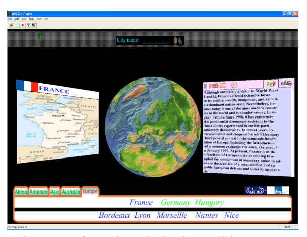
Figure 5: Information Display in English.

XLIFF/MLIF document. Figure 5 shows the same application once user has chosen to see information in English.