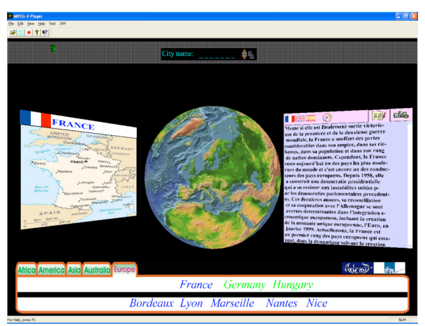
Figure 4: Information Display in French.

In the framework of ITEA project "Jules Verne", an MPEG application has been developed. This application shows an interactive globe in the middle of the screen and two other display boards on either side of the globe. In the display board on left, it shows the map of the country chosen and on right side it shows the historical information about the country chosen. This also has some flags on the display board on right. User can click on any of the flags and the historical information is displayed in the chosen language. This information is encoded in formats XLIFF/MLIF document (both completely interchangeable with the help of stylesheets). This information is extracted from the document, on run time, with the help of chosen parameters for language identifier and country name identifier.