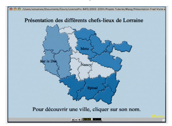
Figure 2: An Interactive MPEG-4 Presentation in French.