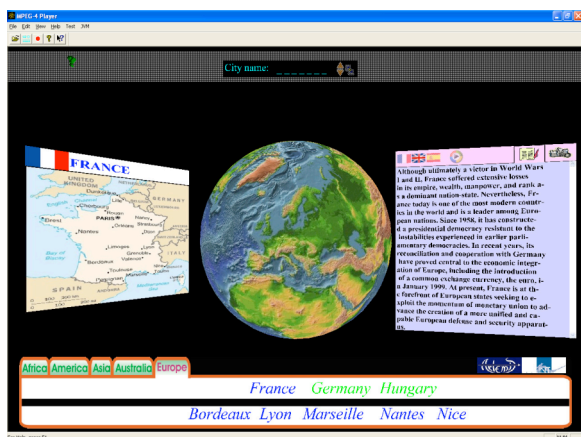
Figure 5: Information Display in English.

XLIFF/MLIF document. Figure 5 shows the same application once user has chosen to see information in English.