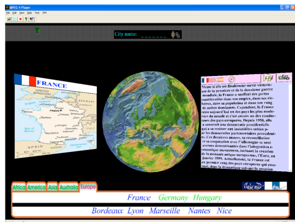
Figure 4: Information Display in French.

In the framework of ITEA project “Jules Verne”, an MPEG application has been developed. This application shows an interactive globe in the middle of the screen and two other display boards on either side of the globe. In the display board on left, it shows the map of the country chosen and on right side it shows the historical information about the country chosen. This also has some flags on the display board on right. User can click on any of the flags and the historical information is displayed in the chosen language. This information is encoded in XLIFF/MLIF document (both formats are completely interchangeable with the help of stylesheets). This information is extracted from the document, on run time, with the help of chosen parameters for language identifier and country name identifier.