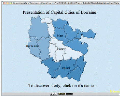
Figure 3: Interactive Presentation in English.