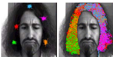
Fig.1. Influence of silk-attraction factor on webs for detection region

A grey level image is the environment in which agents will evolve; stakes correspond to pixels and the height to their grey level. The behavioural items of agents are similar to SA. The movement remains unchanged and silk fixing now depends on the context and, thus, is related to the grey level of the region to detect. The interaction principle is based on stigmergy. To avoid different regions of the same grey level being woven on a unique web a third behavioural item was added to make an agent probabilistically return back to the web [19]. All agents have the same features determined by four parameters. Two parameters govern the movements of the agents and thus the exploration process. The two last ones are related to the selection of pixels, thus determining the relevance of the extracted region. Because the process is based on the stigmergy ensured by the silk draglines laid down in the environment, selection and movement are tied. But we could initially specify the influence of silk attraction factor as shown in figure 1: when it is high (the left picture) the five agents construct five different webs and do not explore the entire region. When it is low (the right picture) the region covered is bigger and corresponds to a collective web. Thus, when well chosen the parameters for stigmergic process allow decentralised coordination.