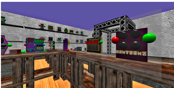
Figure 2: A virtual shop with all available WAM 3D models displayed. Once picked, the WAM can be positioned in space.

Complementing these features, a new 3D Plugin Shop provides a spatial interface where plugins are displayed as 3D objects on virtual shelves, offering a more intuitive and engaging alternative to the floating text-based menus used in earlier versions.