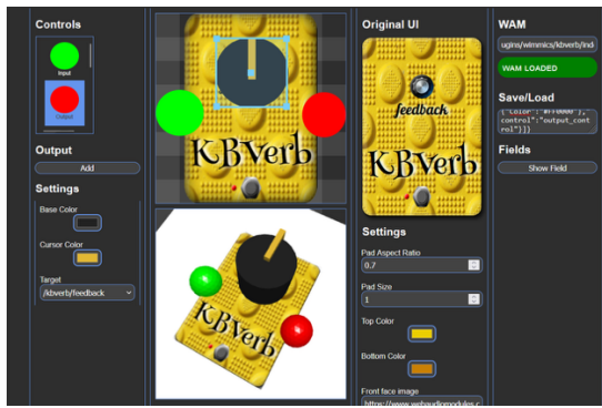
Figure 1 : A 3D Graphic Editor for designing 3D GUIs for existing WAM plugins, without modifying their source code.

This new version of WAM Jam Party introduces a 3D graphical editor that brings the focus to expressive interaction and immersive design, allowing users to create fully customized, more recognizable, plugin interfaces with unique 3D visuals, animations, and physics-driven behaviors.