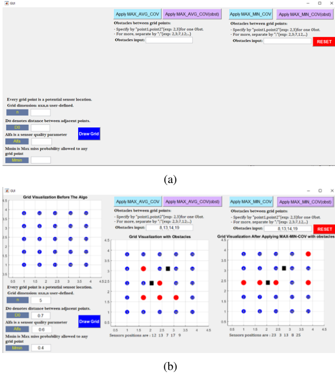
Fig. 3: Graphical User Interface GUI for the WIoT Data Simulation Configuration (a) including text boxes for entering input features, and (b) drawing the environment grid and visualizing WIoT placement outcomes.

By adjusting the inputs (grid size n , sensor quality \alpha , spacing between grid points d_0 , and obstacle layout), we perform multiple simulations to observe the placement behavior across diverse scenarios. This iterative testing provides a broad set of results, allowing for in-depth analysis of how the algorithm adapts to different deployment constraints and objectives.