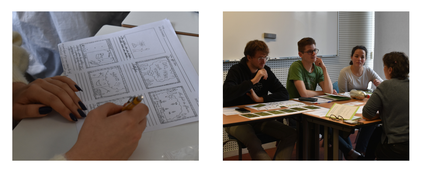
Figure 3: Left: Game proposition using storyboards. Right: Group collaboration and interaction during the workshop.

TEI '25, March 4-7, 2025, Bordeaux / Talence, France