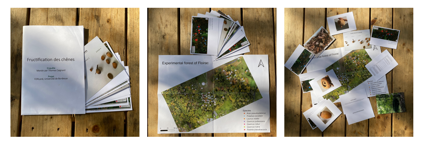
Figure 1: Example material from the booklet "Fruiting Phenology of Oak" [15]. Left: Layout and Structural Overview. Middle: an overview map to help readers orient themselves in the forest and associate material in the booklet with the location where it was collected. Right: example photos of material collected by researchers, e.g. acorns in different states of development and nets used by researchers to collect and count leaves and fruits falling from trees.

TEI '25, March 4-7, 2025, Bordeaux / Talence, France