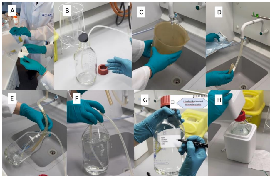
Figure 2: Sampling overview: (A) Wear gloves and sterilize them before you start. (B) Flush the provided glass bottle with the nitrogen. (C) Flush the pipes properly before sampling. (D) Connect the tubing to the tap. (E) Sample the water while continuously flushing the bottle with nitrogen. (F) Fill the bottle to 2/3 volume and continue flushing with nitrogen. (G) Close the bottle and write the label. (H) Pack the bottle into a styrofoam box.