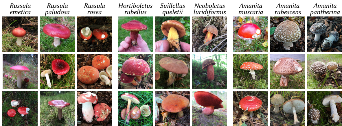
Figure 1: Fungi species intra- and inter-class similarities. Visual similarities and differences across nine selected species and three distinct families (i.e., higher taxonomic ranks). Image taken from [8].

such as humidity, light exposure, and soil type can further influence their appearance [4, 5]. These variations pose a considerable challenge for automatic recognition systems, which must be robust enough to account for such differences to ensure accurate identification. Moreover, the quality and resolution of images submitted for recognition can vary significantly, impacting the system’s ability to accurately classify the observations. Images taken in the wild might suffer from poor lighting, occlusions, or background noise, adding another layer of complexity to the recognition task [6, 7]. These challenges underscore the importance of developing new methods capable of handling the complex details of fungal diversity, pushing the boundaries of current state-of-the-art in fungi species recognition, and fine-grained visual categorization in general.