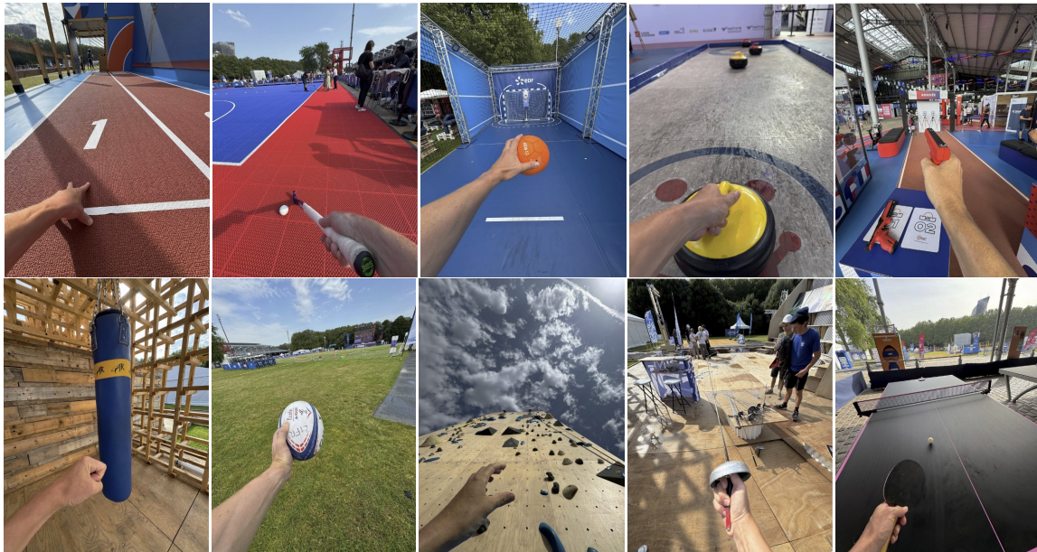
Figure 1: Examples of first-person views that can benefit from embedded visualization designs to help the athlete improve their performance or learn the sport.

Romain Vuillemot‡ Ecole Centrale de Lyon LIRIS UMR 5205