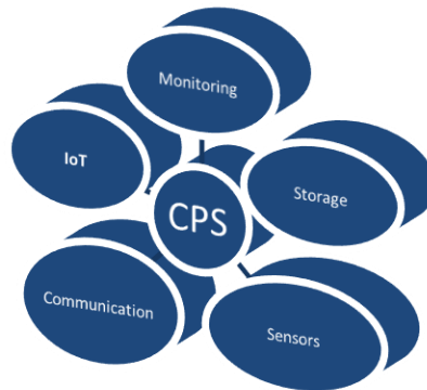
Figure 3. The concept of cyber-physical systems

The largest number of analyzed papers, as many as 72 papers, indicate a direct link between productivity and digital technologies used in the digital transformation and implementation of smart factories. Almost all of these isolated studies imply that digital technologies have a positive impact on the productivity of manufacturing companies. The productivity of smart manufacturing systems is undoubtedly very closely related to the application of digital technologies shown in Figure 2.