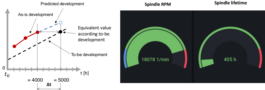
Fig. 4. Spindle wear quantification and lifetime visualization

The application visualises the evaluation (see Fig. 4), i.e. the detection of events on the basis of the forecasts. This can mean, for example, that a threshold value for the expected remaining useful life of a component has been undershot. It can also indicate that the remaining useful life can be extended if the machine utilisation is reduced. When stating the remaining service life, it is important to note that the result is subject to certain uncertainties and cannot be absolutely reliable. This is due to the fact that both the correction factors and the designed load cycle number are statistical values that are subject to certain probability distributions.