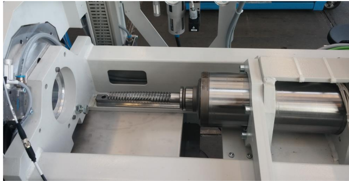
Fig. 1. Housing with the spindle bearing and the mixing screw of the injection unit

The approach for assessing machine component health is tested on a reaction casting unit, which includes a mixing screw with spindle and associated bearing (see Fig. 1). Within the unit, polyol is mixed with isocyanate in a chamber with the aid of the screw in order to obtain a reactive mixture that foams up within a mould. The spindle bearing was identified as a critical component, as its failure or impairment of its original function causes machine downtimes. Currently, the machine condition is qualitatively assessed and communicated by the operator. In particular, the expertise of the operating personnel is used to document whether, for example, unusual behaviour such as vibrations and disturbance variables have been detected.