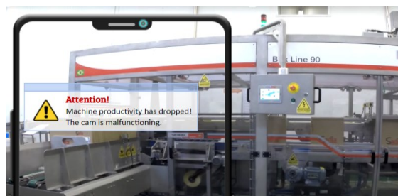
Fig. 2. Proactive case, warning about the machine's situation

Proactive Behavior Scenario. This scenario refers to when maintenance operators leave the maintenance office and go to the shop floor for their daily routine after knowing which machines should be checked and maintained. During their walk the machine's softbot warns them that the respective machine has an issue after receiving some information from sensors. This warning is sent out in an AR way (Fig. 2) when the softbot detects that a maintenance operator is close by the machine (this automatic 'detection' has been so far implemented only in a simulated way), or via sending a SMS message to the operator's smartphone.