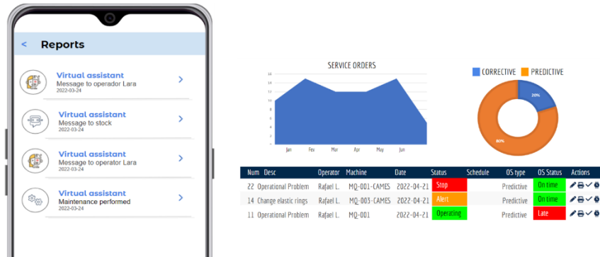
Fig. 4. Planned case, generating reports automatically