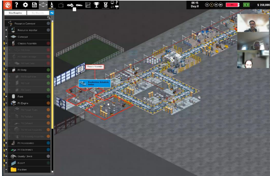
Fig. 1. A screenshot from Production Line by Positech played by the authors during a test session in April 2022.

necks and improve performance are not only tasks inherent to the game but also main tasks related to the authors ILOs as will be explained in the following.