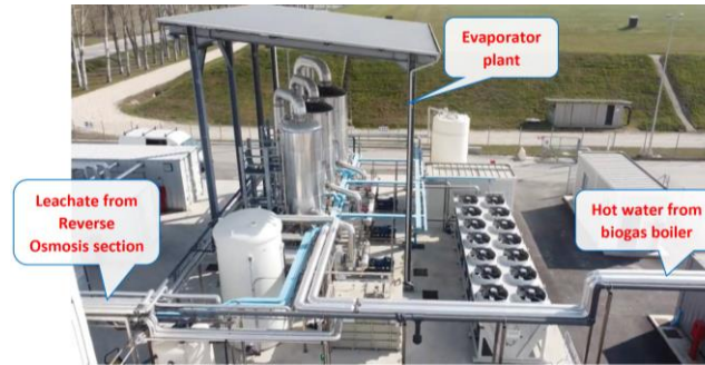
Fig. 2. Evaporation plant: top view