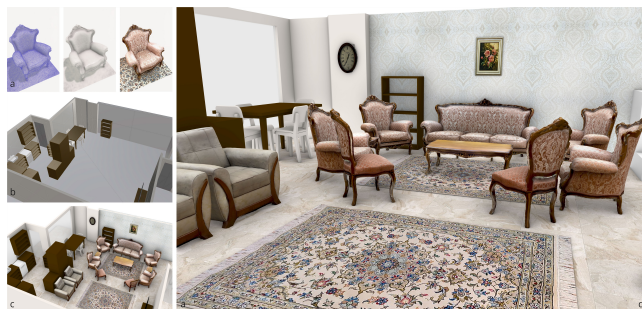
Figure 1: “Cultural Windows” workflow for immersive global interiors: (a) 3D scanning unique design elements, (b) Ensuring privacy with generic, non-photorealistic models, (c) Incorporating 3D models with original textures, and (d) Finalizing the scene for VR.