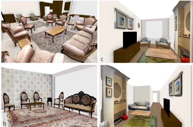
Figure 3: Final reconstructed 3D models of the living spaces, ready for VR integration: (a) Room No. 1 in Tehran, (b) Room No. 2 in Tabriz, (c) and (d) Room No. 3 in Tehran.

design elements in an immersive setting. Figure 3 illustrates final reconstructed 3D models of the living spaces used for this project.