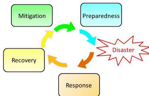
Figure 1: Disaster Management Cycle

As depicted in Figure 1, the disaster management cycle encompasses four critical phases: response, recovery, mitigation, and preparedness [27,28].