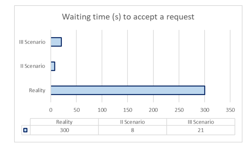
Fig. 2. Comparison of waiting times (in seconds) for accepting a request in reality (model as-is) and in the two proposed improvement scenarios.

Results of improvement scenarios. Figure 2 highlights the key improvements in terms of waiting times in the second and third scenarios. The proposed scenarios were evaluated by the staff of the patient transportation service provider, and was characterised by a continuous questioning between them. Moreover, they performed systematic questioning aimed at checking that the patient's safety and his/her life were considered absolute and inviolable priorities.