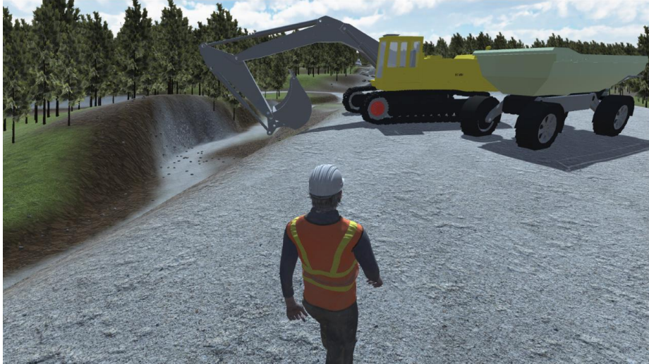
Fig 5 The user can explore the site following a virtual operator showing the construction equipment and operations.

The study was developed as a proof-of-concept featuring a realistic setting and showed the potential to quickly forecast, in an early stage of development, the economic and environmental impacts of new machines and systems configurations. This capability is expected to consistently reduce the development time and the time to market for cost-efficient autonomous solutions based on electromobility in the construction equipment, speeding up the shift to a fossil-free industry, while, at the same time, lowering the environmental impact and delivering a safer workspace by moving away workers from the risky environment.