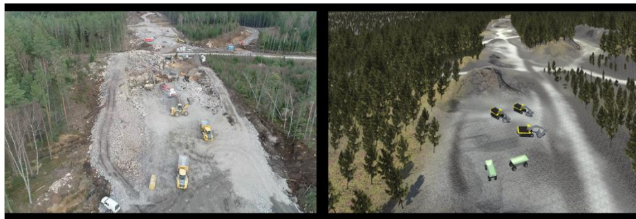
Fig. 3 Screenshot from the camera drone video used to generate the virtual scene and the corresponding 3D virtual environment.