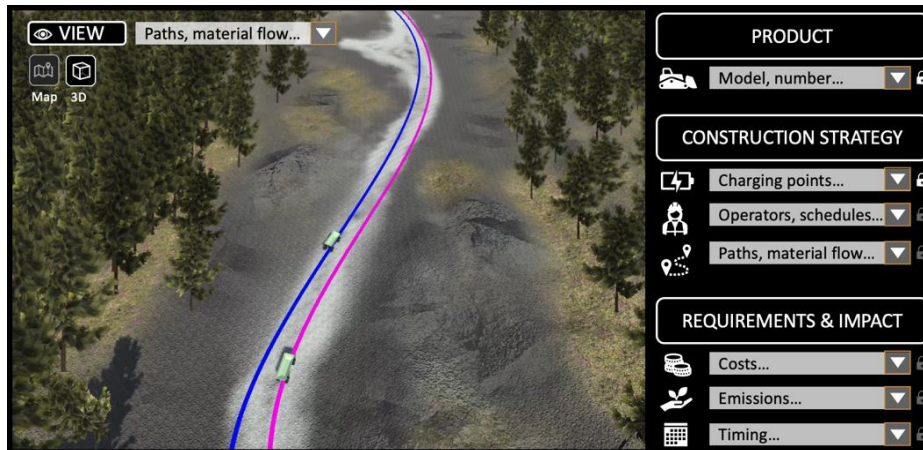
Fig 4 Application interface. On the right, is an example of a 3D view of vehicle paths. On the right, are possible factors to manipulate and simulate in the virtual environment .

This visualization framework is intended to be integrated with simulation models and external data platforms related to the various scenario, displaying system requirements, resources demand, operators needed, consumption data, financial, and overall sustainability impact of different alternatives. Finally, users would be able to set system constraints in terms of resource demand and consumption, individuating the optimal solution matching their overall needs and expectations. Specifically, they would decide the parameters to set as independent variables and see how they affect the whole system.