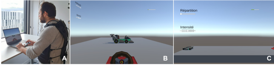
Fig. 1: User evaluation setup: the experimental setup (A), the user point of view of a scene playing out (B) and the user customization parameter sliders (C).

customize a single effect or to customize the full haptic experience. Moreover, limiting the customization process to only two parameters allow users to fine-tune the haptic experience while maintaining a reasonable level of effort and complexity.