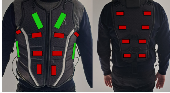
Fig. 2: Distribution of the 20 vibrotactile actuators on the Skinetic haptic vest by Ac-tronika. The vest contains two sizes of actuators. Small (red, 16): 4 on the left front side, 4 on the right front side and 8 on the back. Large (green, 4): one at the top front left, one at the top front right. And one on each side.