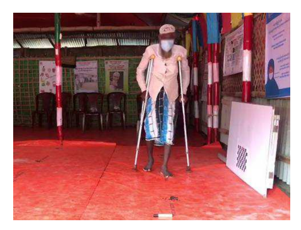
Figure 1. Front view of participant's walk