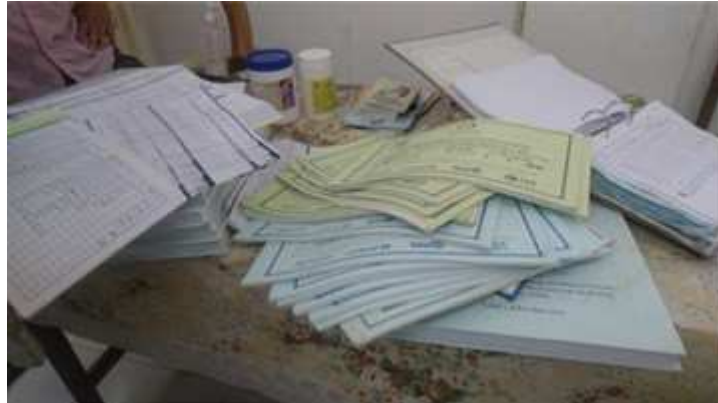
Figure 1. Collection of active log books and paper tools in one health center

A similar, but somewhat simpler solution was suggested for the MCH ANC program where only the ANC first visit cases, linked to the village, would be included. This would enable the key ANC related indicators to be calculated and, given that each case would be registered electronically, validated.