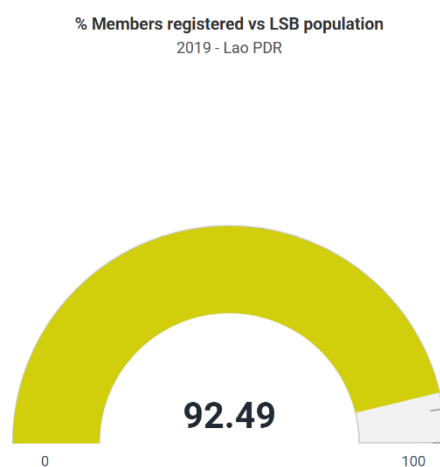
Figure 3. Households registered versus census estimates

The data from the survey is compared with the census estimates which are calculated for the facilities by the district staff. As illustrated in Figure 3 most of the households are included in DHIS2.