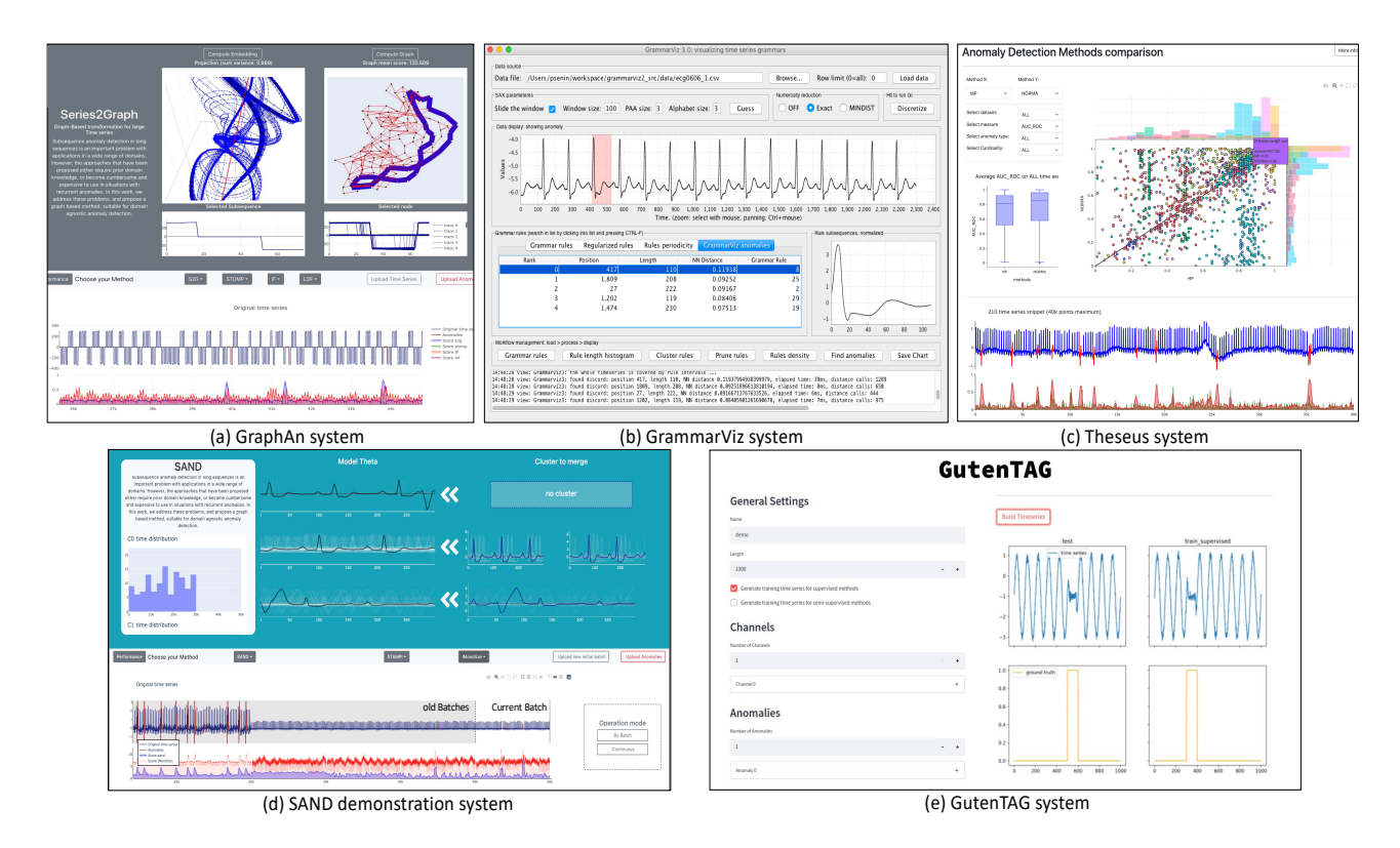
Fig. 3. Example of interactive systems that (a,b,d) allow the user to dive into computational steps [58], [59], [60], or (c,e) experimental results [61], [62].

[Experimental Evaluations] Then, we will discuss recent benchmarks proposed for anomaly detection in time series task [33], [31], [32], [64], [30]. Such benchmarks provide an extensive collection of time series from various domains and evaluate multiple methods belonging to the aforementioned categories. In this tutorial, we will discuss the results and conclusions of these recent benchmarks, as well as the criticisms that have been expressed about the characteristics and suitability of some datasets for this task [65], [30].