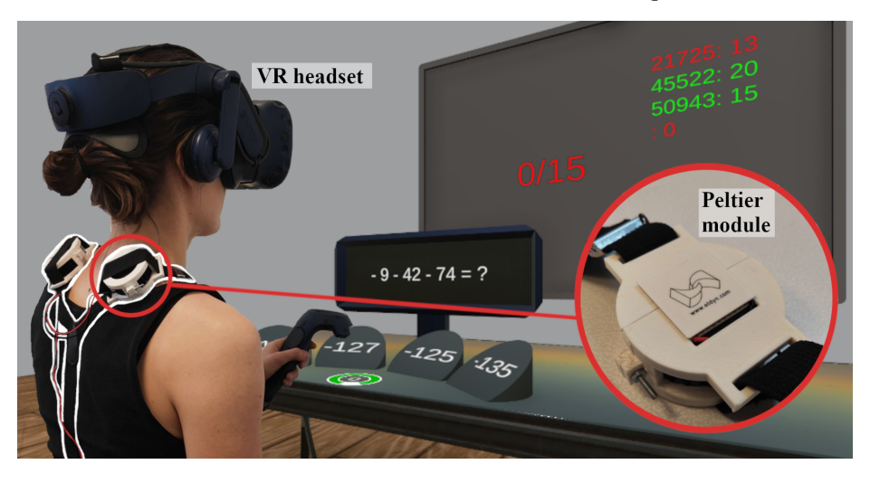
Fig. 1. Participants were immersed in a virtual room where they answered arithmetic questions for 5 minutes. During this period, the two Peltier modules strapped to their backs either warmed up, cooled down, or stayed neutral.

Thermal feedback Thermal feedback was applied on the trapezius with a wearable device made of (Fig. 1). On the straps of the suspenders were sewn two pieces of 3D-printed pieces to hold a thermoelectric Peltier ( European Thermodynamics , 5.3 V, 1.1 A, 2.9 W, 30 mm x 30 mm) cell and a heat sink that could slide along the straps. The Peltier cells were connected to an Arduino UNO board through DC motor drivers (DRV8838). Two external power supplies (5 V, 2.2 A max) powered the Peltier cells. Participants wore tank tops so the cells would directly touch the skin.