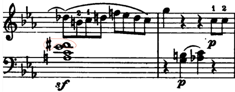
(b) Mozart, Sonata no 14 in c minor, mvt 1, measures 125-126.