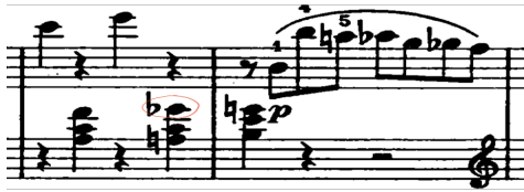
(a) Mozart, Sonata no 14 in c minor, mvt 1, measures 56-57.