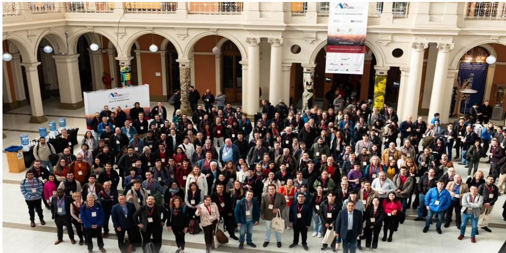
IFORS 2023 attendants say hello to the rest of the world!

(An extended version of this text has been published also in the September 2023 IFORS Newsletter)