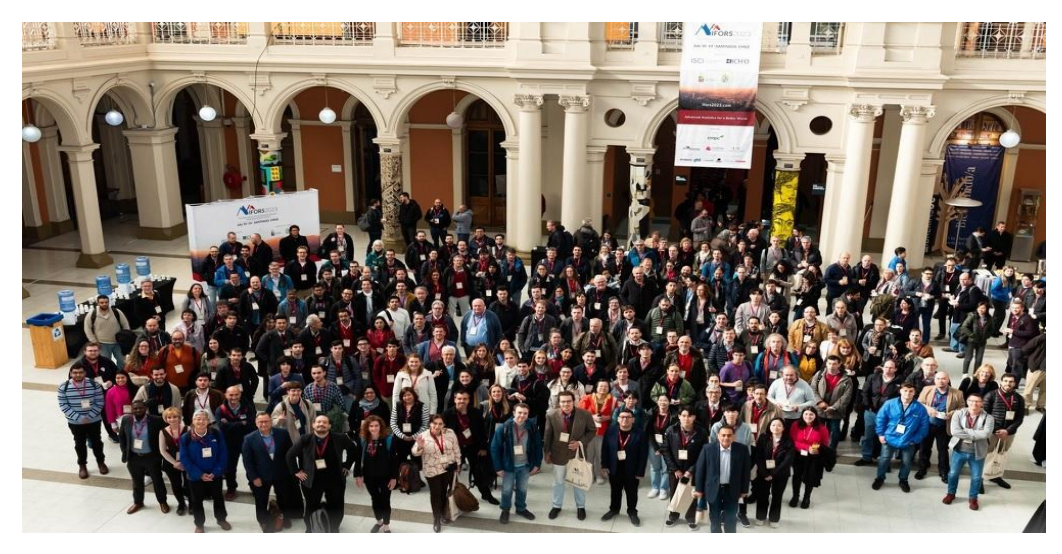
IFORS 2023 attendants say hello to the rest of the world!

(An extended version of this text has been published also in the September 2023 IFORS Newsletter)