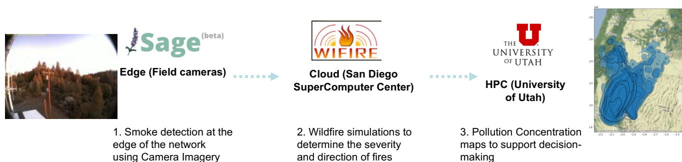
Fig. 1: Monitoring and managing the air quality impact of wildfires – This driving urgent application usecase is designed using R-Pulsar to composed sensors provided by the SAGE platform align, wildfire data and model provided by the WIFIRE platform along with local pollution concentration maps, all distributed across the computing continuum.

aged potentially enable urgent computing across the computing continuum to support this usecase.