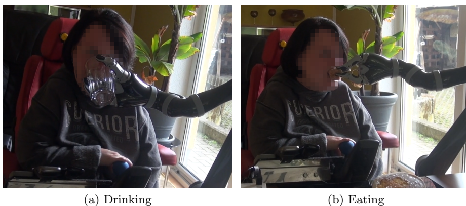
Fig. 5: Observation on the use of a robotic arm (JACO) for the consumption of food and drinks

Use of a Robotic Arm during the Study One participant (P15) has rudimentary mobility functions in her lower right arm which allows her to use a joystick-controlled robotic arm for nearly every activity of daily living including consuming food and drinks, manipulating objects and basic hygiene. Figure 5 illustrates how she handles the tasks with her robotic arm.