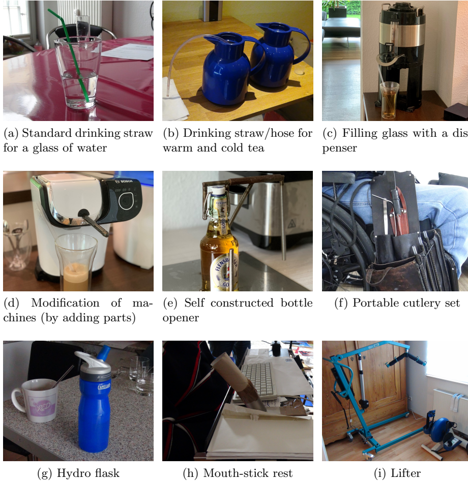
Fig. 4: Analyzed aids in the participants' homes which are currently used

need for re-filling by an assistant. We recorded images of these aids to increase our understanding of the help people need and want when confronted with tasks they cannot independently do anymore.