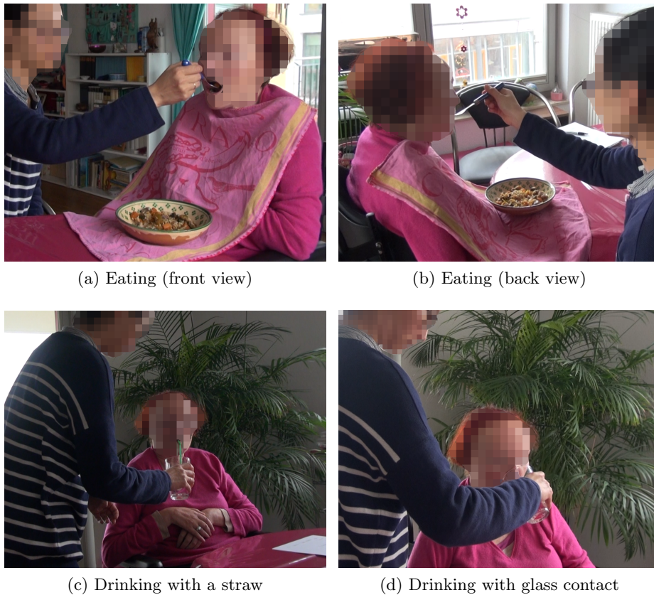
Fig. 3: Observation of eating drinking habits together with their caregiver

Participatory Observations This part of the study focused on observing participants consume food and drinks (cf., Figure 3) with the assistance of their caregiver. Observations of the relative location of the assistant, the methods used, and the communication between both parties were recorded. Depending on the specific type of impairment participants were either laying in their beds or sitting in their wheelchairs. Filming these interactions allowed for easy access during data analysis.