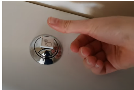
Fig. 3. IntraVox prompts users to wash their hands after using the toilet.

Activity: Socially assistive robots can support people with dementia by prompting interventions when a behaviour change is detected [16] and motivate them in exercising using personalized messages [17]. We, therefore, expanded the previous Activity Scenario to engage users with home-based exercises. Based on the user’s daily routine and necessities, whenever inactivity is being detected, the Raspberry Pi would send an instruction to Alexa to start a workout routine: “ You haven’t been active in a while. You should work out, it’s good for you. Alexa, start 7 minutes workout [Alexa Skill]. ” (Concept 3 and 4).