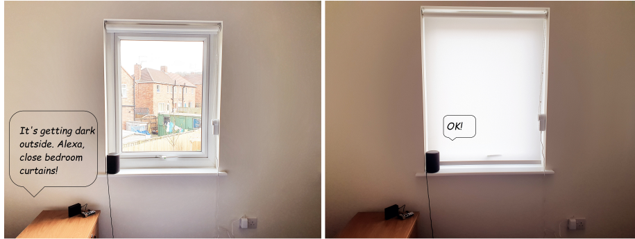
Fig. 2. IntraVox sends instructions to Alexa to close the bedroom curtains.

Based on temperature sensor data, the system also alerts users whether it's getting too warm or too cold in a room and to subsequently, turn on or off the heating or open and close a window. This type of message provides a clear justification for why certain types of home automation processes occur.