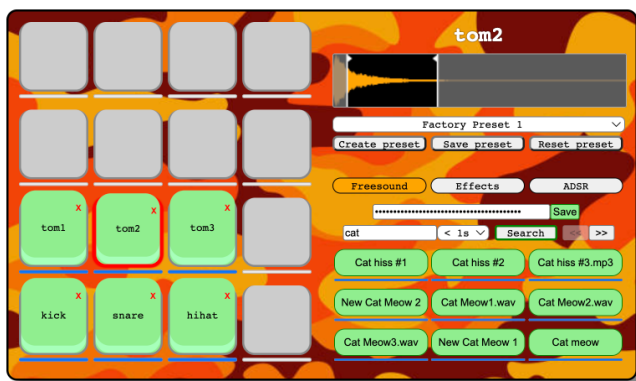
Figure 4: a WAM sampler that can be MIDI controlled, used freesounds.org for finding samples.

Today, a WAM community Github repository proposes dozen of plugins (Figure 3: effects, instruments, utility plugins), an open source DAW called wam-studio 2 (Figure 1) is being proposed as a demonstrator for WAM plugins [4], and a real-time collaborative host called sequencer.party 3 is a great showcase for the WAM standard (Figure 2). We propose to demonstrate the WAM ecosystem at the conference, using an electric guitar [3], microphones, midi controllers, pads for controlling a WAM sampler (Figure 4) etc.