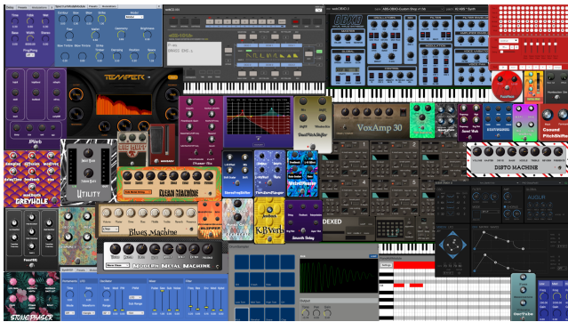
Figure 3: some WAM plugins developed by the community.

node, it also has custom code running in the audio thread. The WAM framework has been designed to handle this particular case and will enable DAW/plugins communication without crossing the audio thread barrier. Let us take one example: while playing, a MIDI track sends notes to a virtual instrument plugin, and changes some of the parameters of this plugin at the frequency rate. Remember that a DAW can have multiple tracks associated to dozen of plugins, and each plugin can have dozens of parameters. The WAM framework detects this case, and will seamlessly use Shared Array Buffers and a ring buffer, without crossing the audio thread barrier. No need to send events from the control/GUI thread, that would have been mandatory if the Web Audio API audio node parameter management was used. To sum up, the WAM framework streamlines the creation of plugins and host applications and enables highly efficient communication between hosts and plugins. A video of WAMs in action is available online 1 .