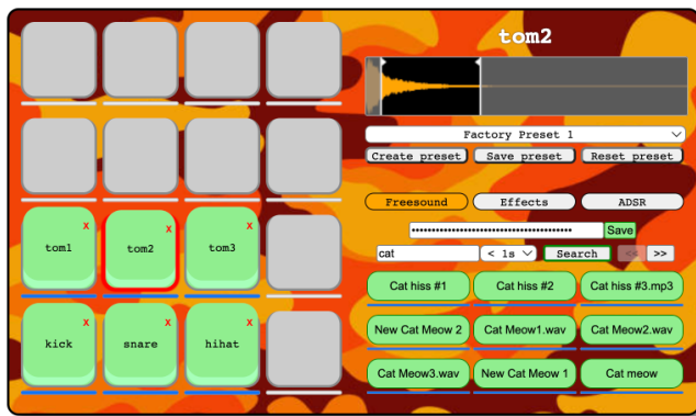
Figure 4: a WAM sampler that can be MIDI controlled, used freesounds.org for finding samples.

Today, a WAM community Github repository proposes dozen of plugins (Figure 3: effects, instruments, utility plugins), an open source DAW called wam-studio 2 (Figure 1) is being proposed as a demonstrator for WAM plugins [4], and a real-time collaborative host called sequencer.party 3 is a great showcase for the WAM standard (Figure 2). We propose to demonstrate the WAM ecosystem at the conference, using an electric guitar [3], microphones, midi controllers, pads for controlling a WAM sampler (Figure 4) etc.