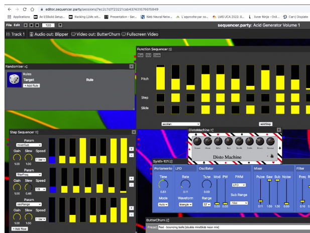
Figure 2: sequencer.party: a collaborative online host. All you see are WAM plugins.

In 2015, Jari Kleimola and Olivier Larkin proposed the Web Audio Modules (WAM)[1], a standard for Web Audio plugins and DAWs. The 2.0 version of Web Audio Modules has been released in 2021 as a group effort by a large set of people [2] and since then, multiple plugins and hosts have been published, mostly as open source and free software. WAM 2.0 comes with a SDK, an abstract API, several open source repositories with dozen of plugins, tutorials, and two hosts for demonstrating the capabilities of WAMs. When we designed WAM 2.0 we wanted to support as many development workflow as possible, from the simple web developer who code on plain JavaScript, the React developer used to build his applications, to the C/C++ developer who is used to pro DSP development and who will cross compile his existing code to WebAssembly and reuse a minimal set of features from the WAM SDK.