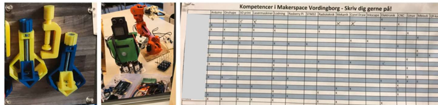
Figure 1. Aggregates of participation displayed in the makerspace.