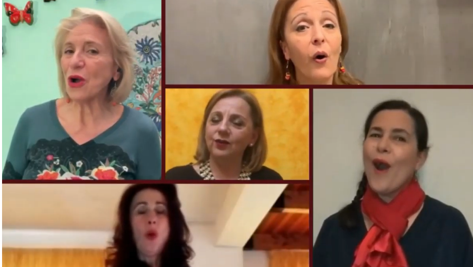
Fig. 1. Asynchronous interaction modality.

Many choristers had serious problems with the use of technology.